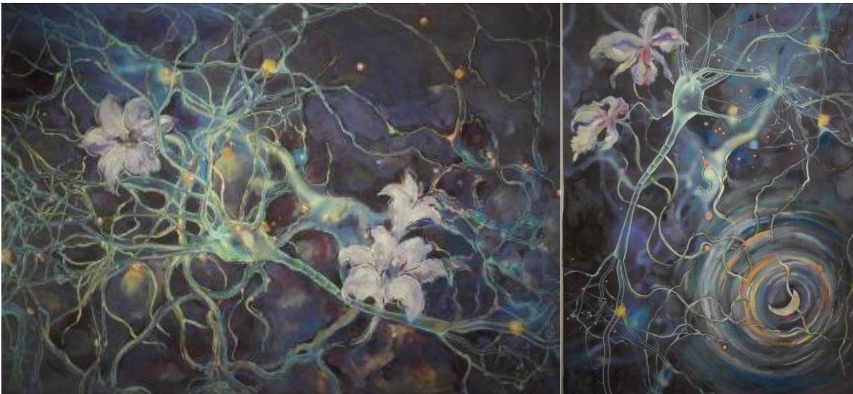
Figure 4 : Author The Moon Down Bellow (details) 2019 Mixed Media on Printed found Image.

As I paint one canvas after another the subject matter and the formal structures remain the same. My paintings became subtler and more layered. But when I paint, the painting as a sensory object occupies my mind and body. These images are not a means to an end; I do not want to depict any particular object in the word. When I am