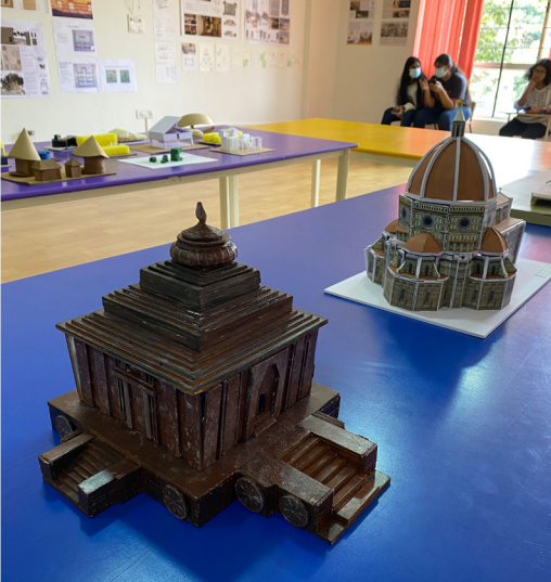
Exploration, communication & Representation of Spatial Design Ideas through diverse mediums & techniques